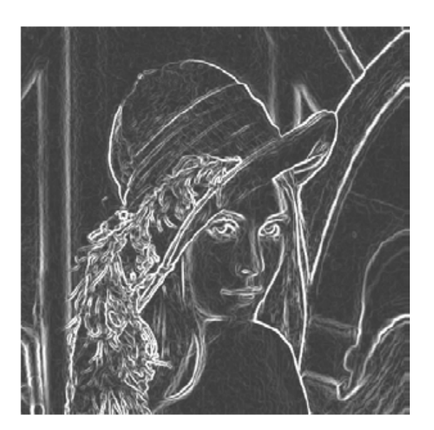
Fig.3. Detected edges by using Sobel operator

It usually involves two stages. The first one is edge enhancement process that requires the evaluation of derivatives of the image and usage of gradient or Laplacian operators (Fig. 3). Such methods as threshold or zero-crossing produce an edge map that contains pixels candidates to be labelled as edge points of the image. But these methods provide not enough information on being a good edge. This limits their ability to exploit local edge continuity information in reducing the edge fragmentation due to noise. Furthermore, because of inherent low-pass filtering, they have a tendency to dislocate edges. To solve these problems there were various attempts taken, including different scale kernels, fitting models of edges, greedy algorithms, dynamic programming and finite element method.