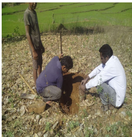
Fig1: (Chiti babu G.) Rice field (Nuakaraju K )Turmeric feild