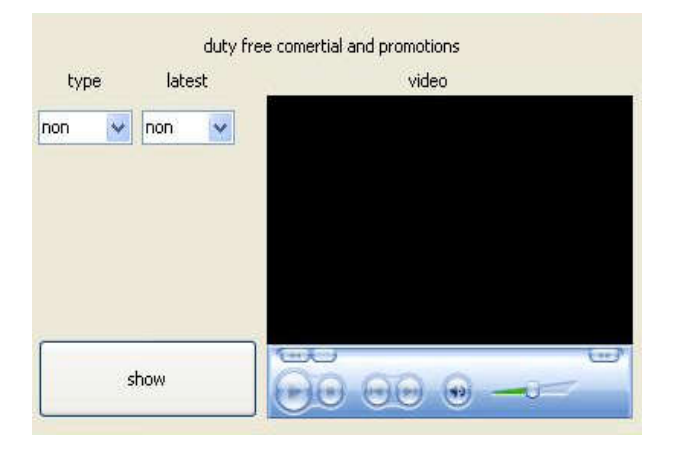
Figure 6. Duty free and stores commercials