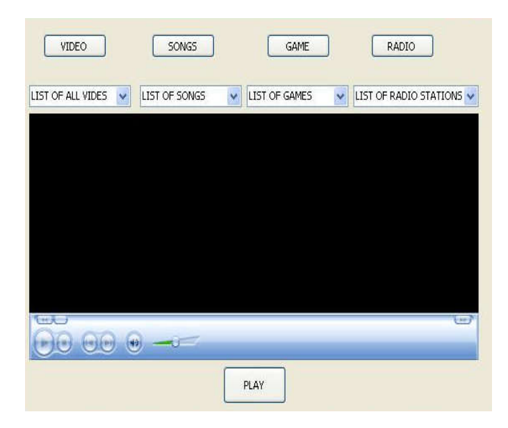
Figure 10. Shows Entertainment Form

Entertainment: This section stores songs, films, and individual and network games to entertainments passengers while waiting in airport for there flight. All Films will be categorized according to their types to romantic, comedy, adventure...etc. also all new films will be downloaded in the device by the airport controller which will be up to date. Extra films could be down loaded by the passenger using USB connection entertainment form is shown in form 10.